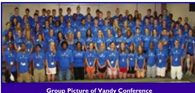
Group Picture of Vandy Conference

field of interest. Twenty-six medical professionals representing athletic training, physical therapy, orthopaedic physicians, personal training, sport psychology and dietetics volunteered their time throughout the course of the weekend. The students left further prepared for a future in sports medicine and with an increased enthusiasm about their career path.