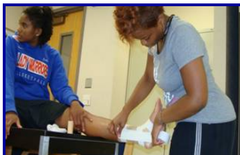
Ankle taping at Vandy Sports Med Conference