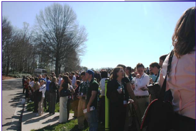
SEATA Educators and Students gather outside of Crown Plaza due to minor fire in laundry area

Get all of the SEATA & NATA News at the SEATA News page, http://www.seata.org/news.htm