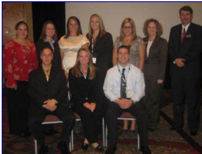
SEATA Case Study Presenters

gram at Union University which had extensive destruction to its athletic facilities from Tornados